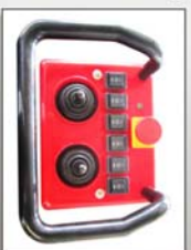
Wireless Remote Control Unit OPTIONAL 遥控可选