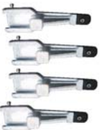
56" Extension Chucks 56" 延伸爪配件