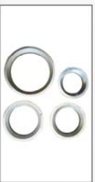
Alu alloy rims protection rings 铝合金轮胎保护圈