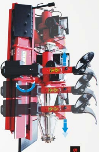
STANDARD ACCESSORIES 标准配件